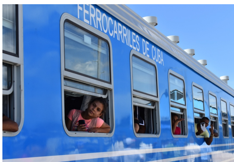
Cuba's Chinese-made first new train passenger cars moved after departing from La Coubre train station in Havana, Cuba, July 13, 2019.

century, with profound and complex changes to the global balance of power, international system and order. The conflict between unilateralism and multilateralism is becoming more acute, and certain powers are bullying others, imposing their political view on the rest of the world. With these changes as a backdrop, China and LAC countries'