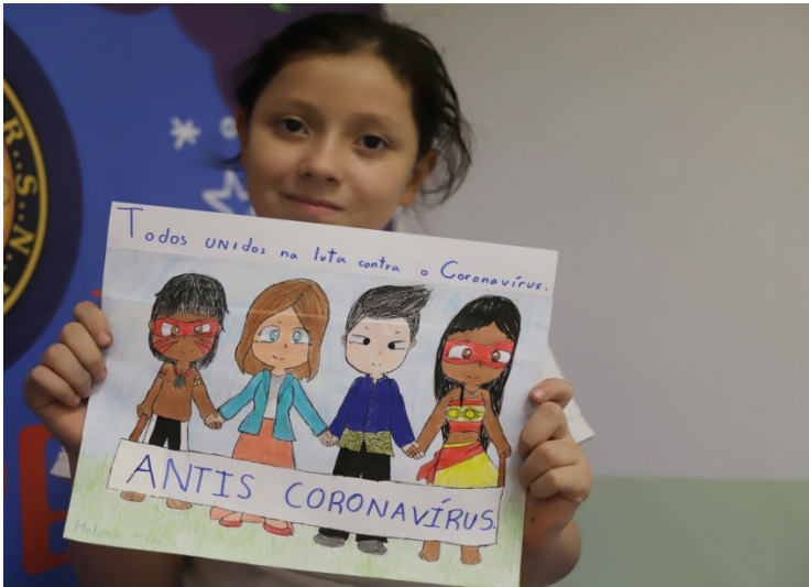
A Brazilian girl displays her painting to support China’s fight against the epidemic.