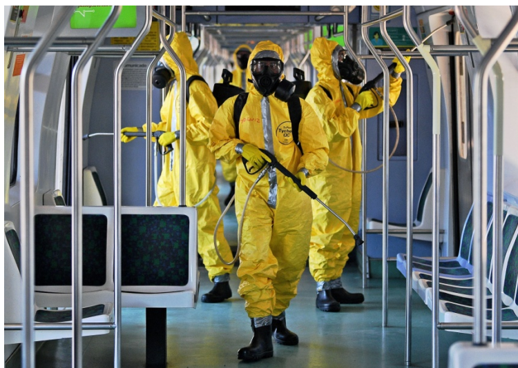
Anti-epidemic personnel disinfecting wagons parked at the central train station in Rio de Janeiro.

By 12:00 on April 12 Beijing time, 61,062 confirmed cases had been reported in the LAC region. The cumulative death toll was 2,556. The outbreak has spread to all 33 countries and 14 overseas territories of European countries in the region. Among them, Brazil is the most serious, with 20,962 cumulative confirmed cases and growing at an accelerating pace. What is even more alarming is that confirmed cases have appeared in the slums of Brazil, which means that a larger scale of outbreak is imminent. Next to Brazil, Ecuador, Chile, Peru and Mexico currently have the most severe outbreak, ranking second to fifth respectively. Overall, the whole region has entered the full-blown pandemic phase.