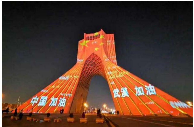
Azadi Tower in Iran was lit up in red in solidarity with China

Besides moral supports, many countries and international organizations have offered donations to China. Up to the beginning of March, Sixty-two countries and seven international organizations have pledged epidemic prevention and control supplies to China. To be specific, supplies from 46