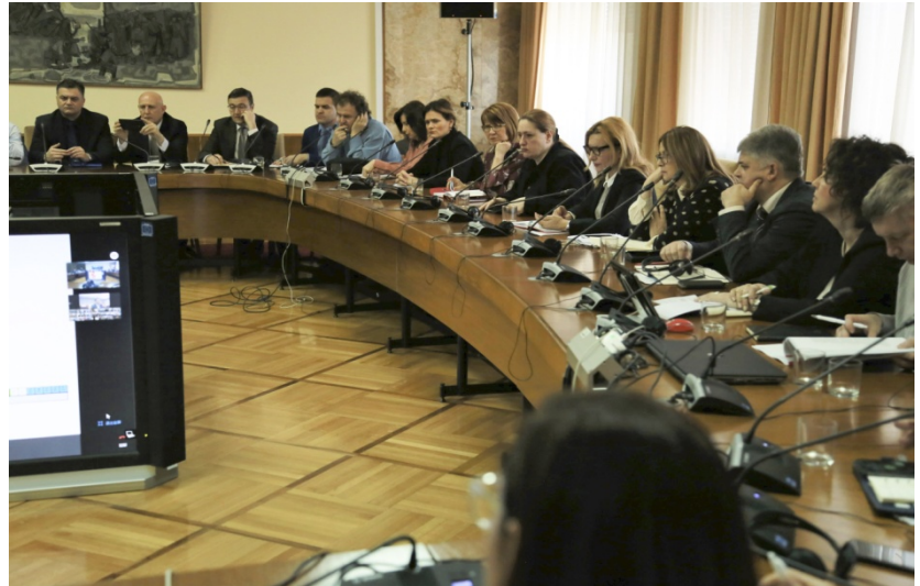
China held video conference on epidemic prevention and control with Central and Eastern European countries: sharing lessons of battling COVID-19 and adding new substance to “17+1 Cooperation.”

We must firm up our ideal to build a community with a shared future for mankind and unit the world as one to battle against the virus. Only in this way can we secure a final victory. Viruses respect no borders and epidemics do cross borders, posing a common threat to people of all nations. Nowadays, in a