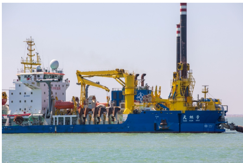
Work and production fully resumed on a 100,000-ton-level waterway extension project, Ganyu Port, Lianyungang.

above-mentioned enterprises, 100% of those with 500 billion CHY or above output value have resumed operation and the number is 98.7% for those whose output value is 100 billion CHY or above. Since February 10, the operation has been gradually resumed in Shanghai Chemical Engineering Zone. Now nearly 100% of enterprises in the zone have resumed