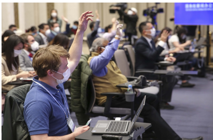
Chinese experts from Hubei medical teams share lessons of treating severe COVID-19 cases on a SCIO briefing.

China has worked closely with relevant international organizations, neighboring countries, and other countries concerned and injected positive energy to global epidemic control. After the COVID-19 outbreak, fully committed to the "people-centered" philosophy of development, China has not